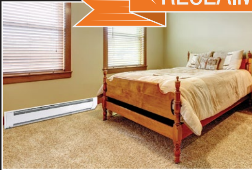
Standard Baseboard Heater