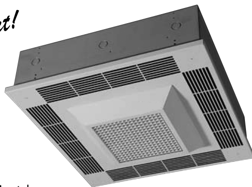
Recess Mount shown