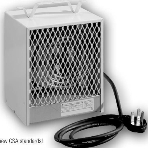
Meets new CSA standards!

The KCH is a high power economy model portable heater designed to provide a back-up heating source at an affordable price. Perfectly suited for the workshop, garage or construction sites, the wall bracket makes the KCH wall or ceiling mountable with 360° full rotation capability. The convenient 6 foot cord allows greater mobility to areas needing heating, while the handle serves as a reel for the cord when not in use. Easily set the desired temperature with the built-in thermostat. A high-limit temperature control with automatic reset provides overheat protection. With a 300 cfm fan, heat is dispersed efficiently. Standard color: almond. 240 Volt Single Phase. One year warranty.